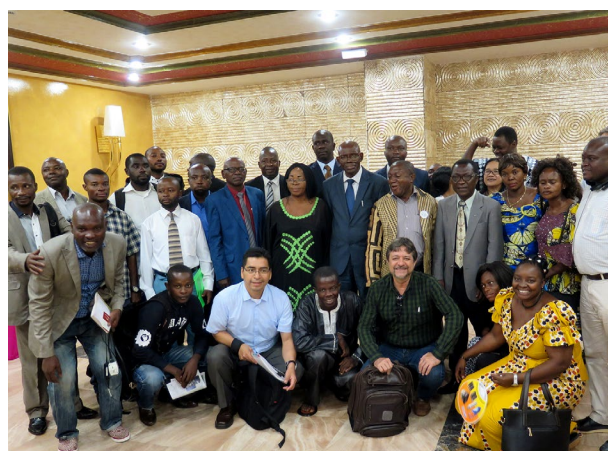
Photo: Attendees at the opening ceremony for the DGM DRC Country Project.

The objective of the DRC country project is to strengthen the capacity of targeted indigenous peoples and local communities (IPLCs) in selected territories and at the national level to participate in REDD+ oriented land and forest management activities.