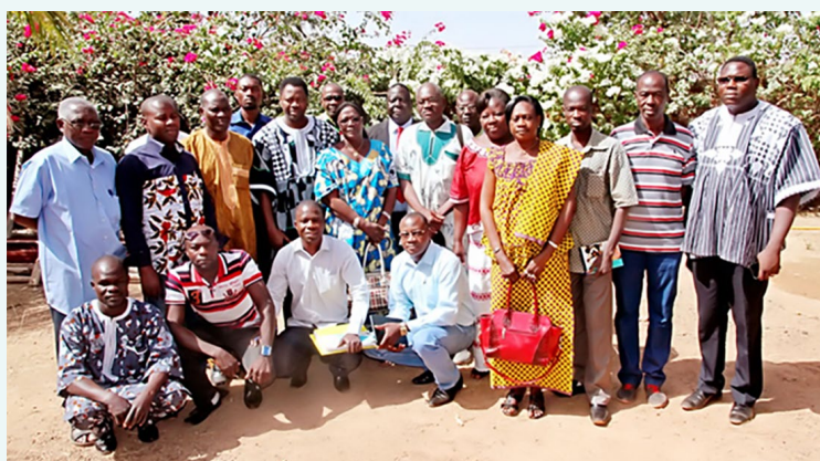
Photo: National Steering Committee Members meet in Koudougou, Burkina Faso as part of the DGM country project launch.

The DGM in Burkina Faso aims to strengthen the capacity of targeted local communities in the targeted regions of Burkina Faso to participate in REDD+ programs at local, national, and global levels. Led by local community leaders, the project will work in 12 provinces and 32 targeted communes prioritized in the FIP investment plan.