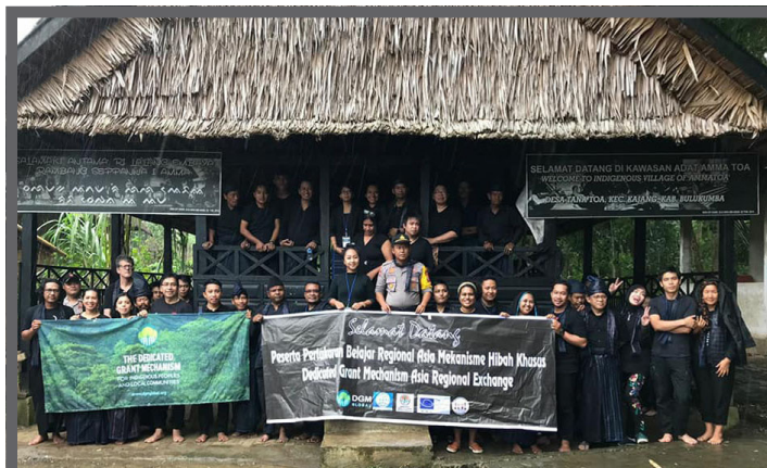
DGM Asia Exchange participants visited the Kajang community in South Sulawesi, Indonesia. The community members wear black to symbolize modesty and humility. During the visit, participants learned about the community's efforts to achieve legal recognition of their customary land.

From February 12-16, DGM Global held its second Asia Regional Exchange in South Sulawesi, Indonesia to facilitate learning and knowledge sharing between Indigenous Peoples and local communities (IPLCs) in Asia on sustainable forestry and climate change