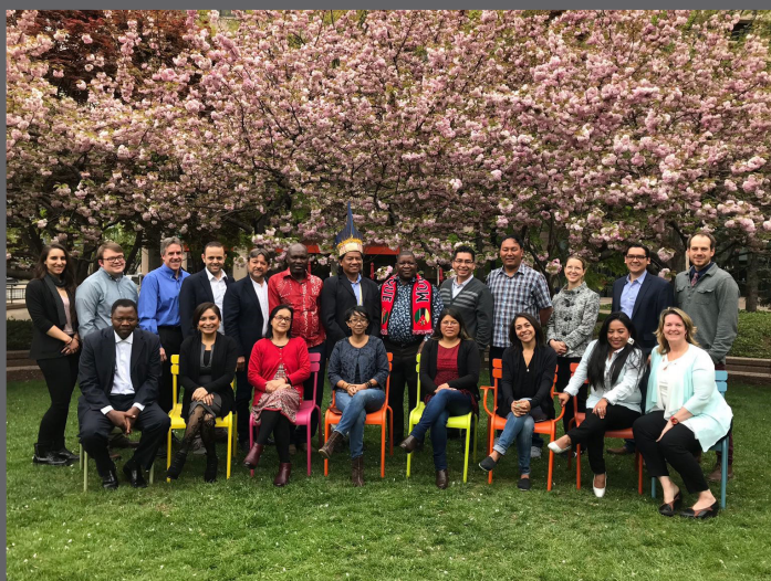
The DGM Global Steering Committee and partners during the Fourth Annual GSC Meeting hosted at Conservation International's headquarters in Arlington, VA.

The Global Steering Committee (GSC) of the Dedicated Grant Mechanism for Indigenous Peoples and Local Communities (DGM) gathered in Arlington, VA from April 23-25 for its fourth annual meeting. The GSC includes representatives of each of the nine operational National Steering Committees (Brazil, Burkina Faso, the Democratic Republic of the Congo, Ghana, Indonesia, Mexico, Mozambique, Peru, and the Republic of the Congo), as well as one representative of a country outside the Forest Investment Program (Philippines). The GSC also welcomed the participation of an observer from the Interim Committee of DGM Nepal.